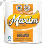
PAPEL TOALHA STY MAXIM 12X2 (50 TOALHA) SKU: 6340