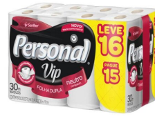
PH PERSONAL VIP FD 4XL16P1530M NEU SKU: 6282