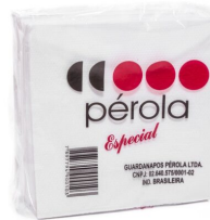
GUARDANAPO PEROLA 30X29,5X30 SKU: 565