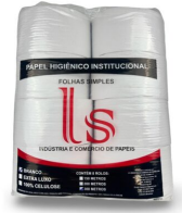
PH LS 300M FRD 8UN SKU: 15610