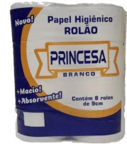
PH PRINCESA 200M FD 8UN SKU: 14236