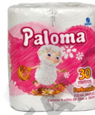
PH PALOMA FS 16X4X30M PERFUMADO SKU: 6390