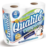
PH QUALITE FD 16X4X30M SKU: 12105