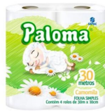
PH PALOMA FS 16X4X30M CAMOMILA SKU: 13065