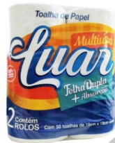
PAPEL TOALHA LUAR 12X2 (50 TOALHA) SKU: 8309