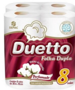
PH DUETTO FD 8X8X30M PERFUMADO SKU: 6287