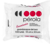
GUARDANAPO PEROLA 50X18X20 SKU: 478