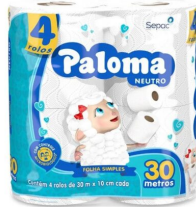
PH PALOMA FS 16X4X30M NEUTRO SKU: 6389