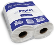
PH PAPIERE 300M FRD 8UN SKU: 11280