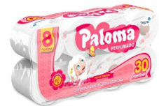
PH PALOMA FS 8X8X30M PERFUMADO SKU: 6030