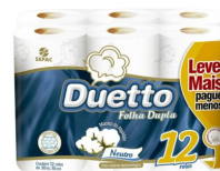
PH DUETTO FD 6X12X30M L+P- NEUTRO SKU: 6285