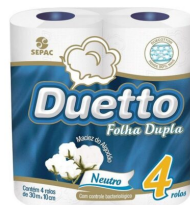
PH DUETTO FD 16X4X30M NEUTRO SKU: 6338