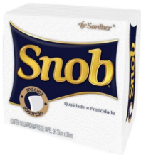
GUARD PAPEL SNOB 33X30X48 SKU: 5516