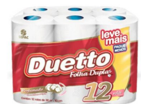
PH DUETTO FD 6X12X30M PERFUMADO SKU: 13412