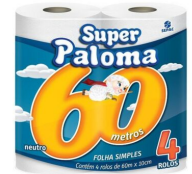
PH PALOMA FS 16X4X60M NEUTRO SKU: 6393