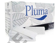
GUARDANAPO PLUMA SACHE 28X20,5CM C/250 SKU: 10793