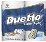
PH DUETTO FD 8X8X30M NEUTRO SKU: 6286