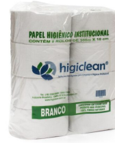
PH HIGICLEAN IND 200M FRD 8UN SKU: 2649