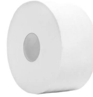
PH PLATIEPEL 300M FRD 8UN SKU: 10946